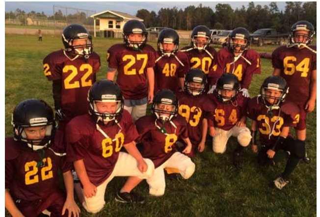
Players in the Grayling AuSable Football League (formerly Grayling Redskins) received new Riddell helmets this season thanks to a grant from the GYBC.