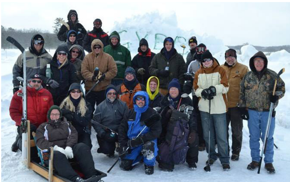
Kevin Howe/The Weekly